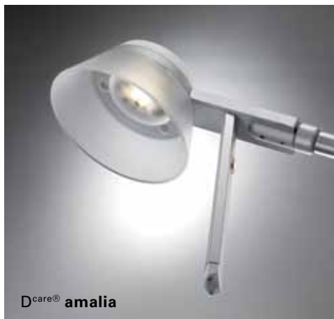
D care ® amalia