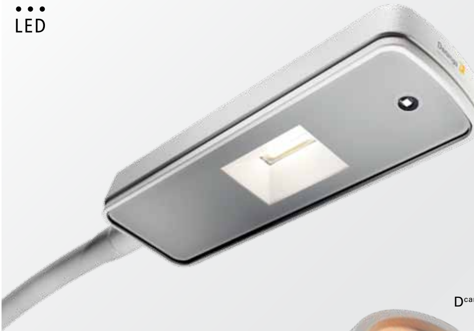
Dcare® melux LED