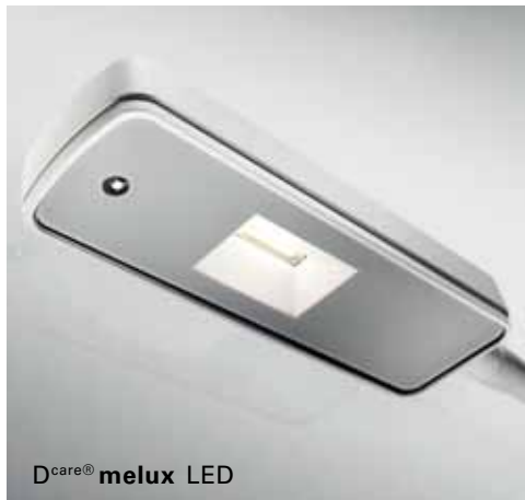
D care ® melux LED