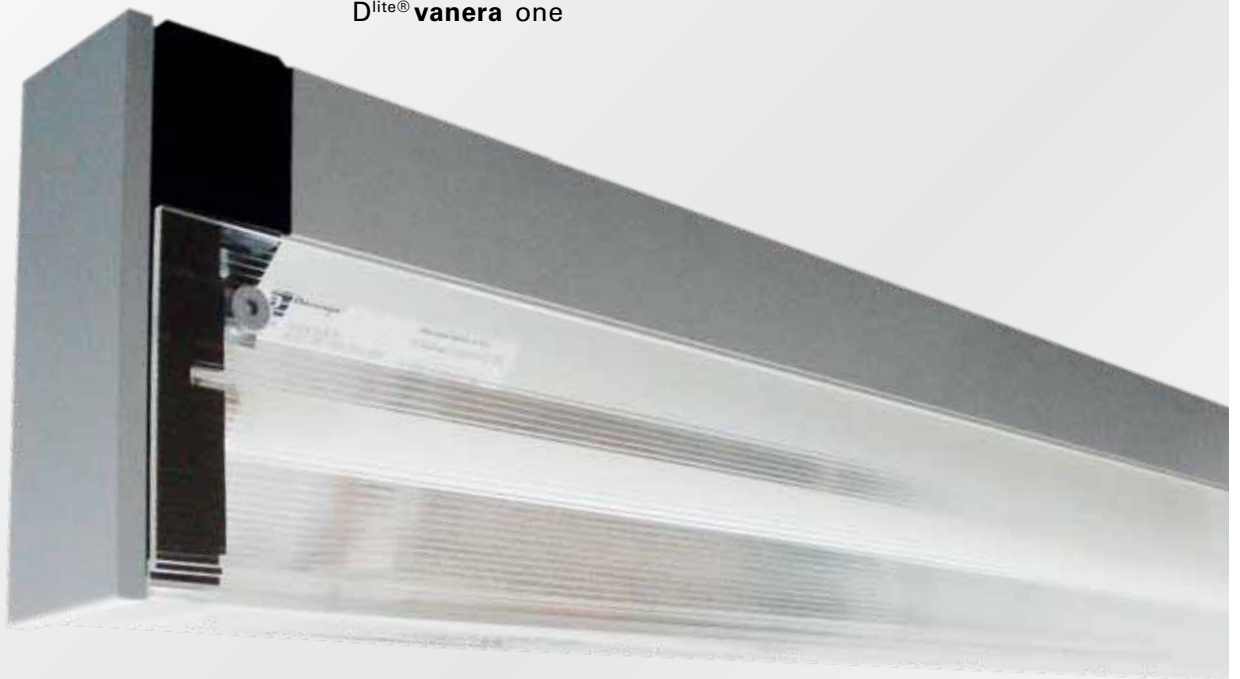
D lite ® vanera one